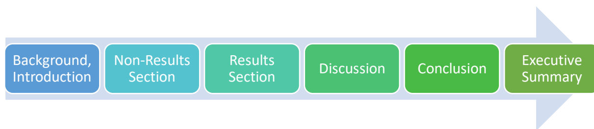
Figure 2: Primary Sections

Typically, the flow of your CSR will progress under six primary headings or sections, not unlike those used in a research manuscript. On the front end, even before the background and introduction, the document will include a title page, synopsis, table of contents, list of abbreviations, ethics statements, and details on the study’s administrative structure. The primary sections to come after that are highlighted in Figure 2 and summarized in turn below.