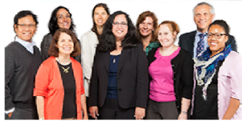
Members of the ACRP New York Metropolitan Chapter

PROMOTING EXCELLENCE IN CLINICAL RESEARCH